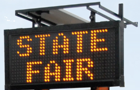
60' x 30" 38mm pixel pitch