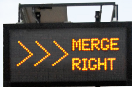
60' x 30" 19mm pixel pitch